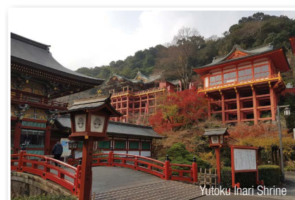
Yutoku Inari Shrine

DAY 3 : NAGASAKI / SAGA / FUKUOKA (Breakfast / Lunch / Dinner)