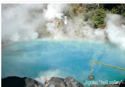
Jigoku "hell valley"

DAY 6 : MIYAZAKI / KAGOSHIMA / IBUSUKI – HOT SAND BATH (Breakfast / Dinner)