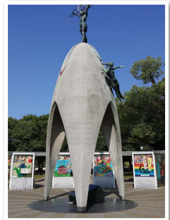
Children's Peace Monument (Hiroshima)

After a good breakfast, we transfer to Osaka Itami Airport for our flight back to Singapore (via Narita / Haneda Airport) sweet memories of ANA First Choice Holiday.