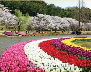
Hamamatsu Flower Park