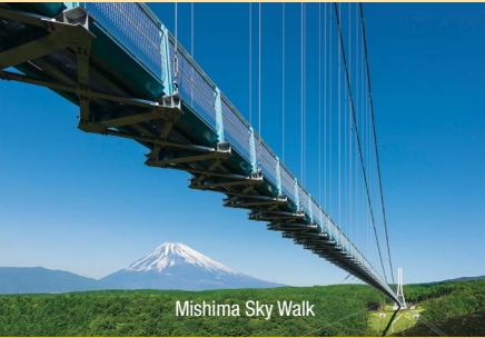
Mishima Sky Walk