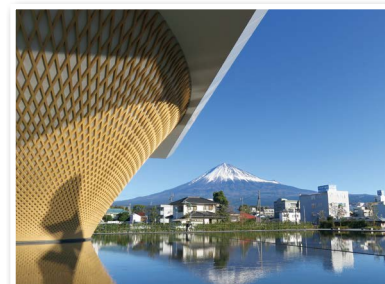
Mt Fuji World Heritage Centre