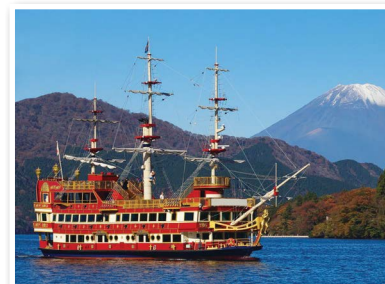
Lake Ashinoko Pirate Ship