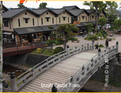
Izushi Castle Town