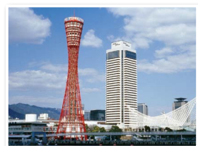
Kobe Port Tower