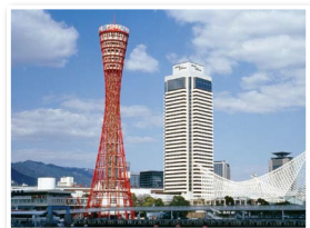
Kobe Port Tower