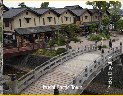
Izushi Castle Town